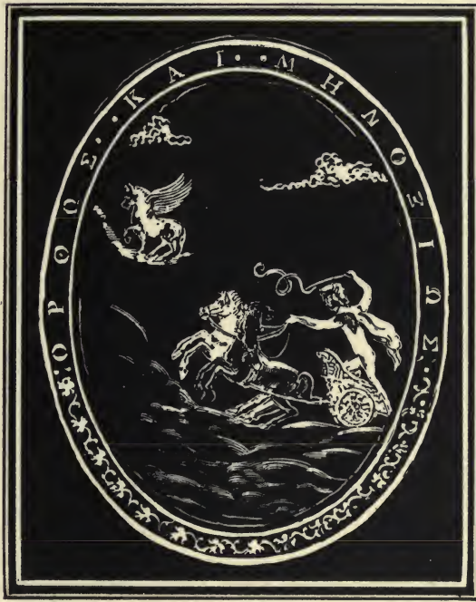
ASCRIBED TO DEMETRIUS CANEVIARIUS.